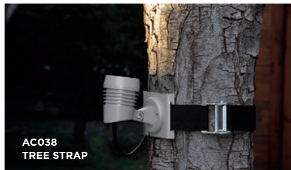
ACO38 TREE STRAP