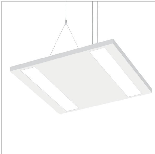
SUN LED 600x600 zwieszany