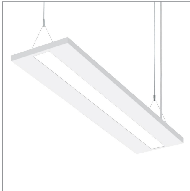
SUN LED300x1200 zwieszany